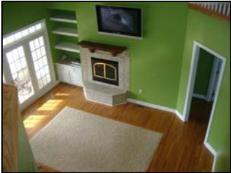
Family Room and Living Room